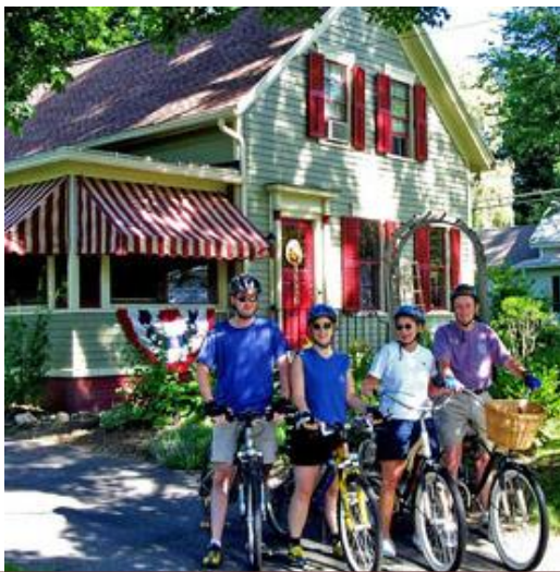
Guests at Sugar Maple Trailside Inn

1 of 3 railroad bridges I have owned in Massachusetts thru my Central Highlands Conservancy, LLC.